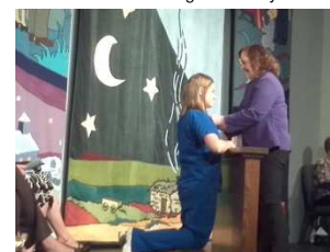
Below: Pinning Ceremony